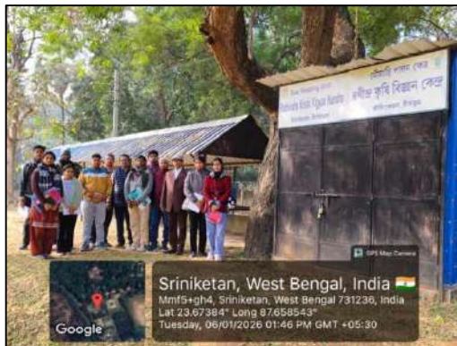
Field Tour for hand on experience on Apiculture