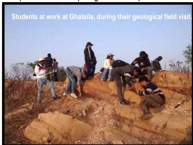
Students at work at Ghatsila, during their geological field visit.

university department under Burdwan University (Burdwan University campus do not house any geology department in their campus). Our alumni are currently serving as geologist under different departments of Govt. of India, Govt. of West Bengal, central PSUs as well as researchers in different universities and institutes.